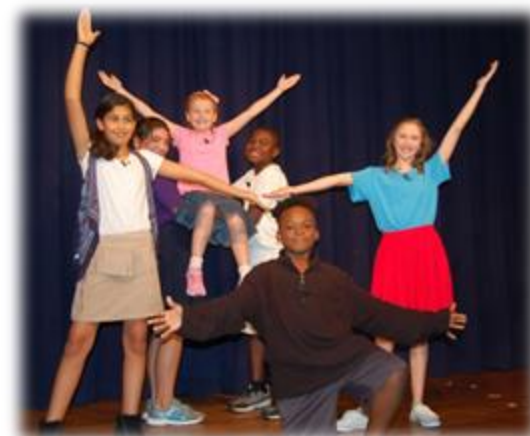
Westside Players Academy 2017 Summer Showtunes ~ A wonderful revival of a decades long legacy!