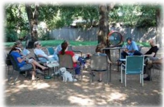
Worship has "gone to the dogs" 1 st & 3 rd Sunday 9am worship service in the Central Dog Park.

We are Stories. People know us by the stories we tell and the ones we create together through shared experience. The same is true of our life in God. We know God through stories others have told - like in The Bible - and the stories of our experiences of God through our lives. In these pages you catch glimpses of stories of lives impacted and communities being healed and transformed. You are asked to imagine how we might deepen and broaden this influence both within and beyond Central Christian Church.